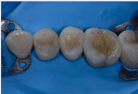
Figure 9. Stratification of the composite resin of dentin shade.