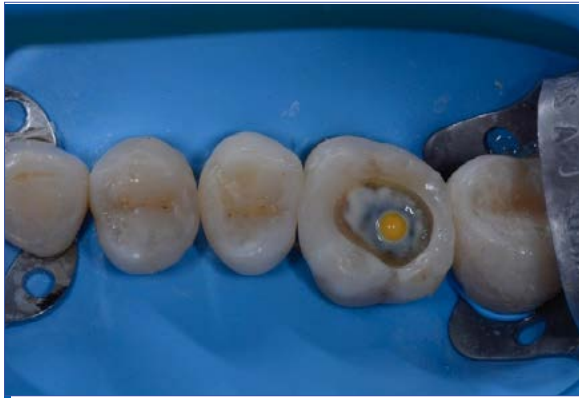
Figure 7. Corn color placement with a small round painter's brush.