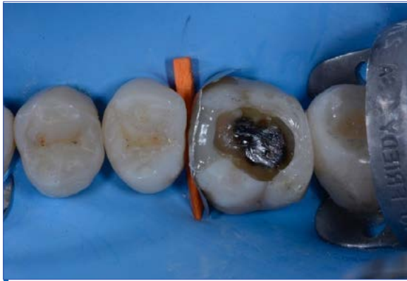
Figure 3. Formation of the distal and mesial walls with enamel shade resin.