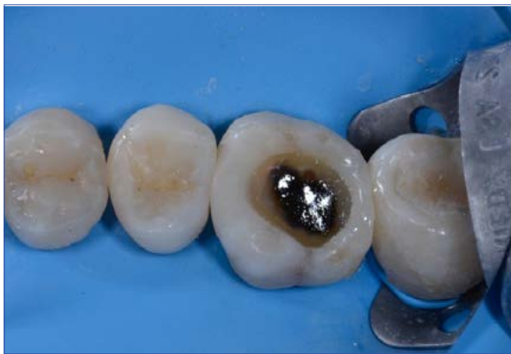
Figure 5. Occlusal view after polymerization of the proximal walls.