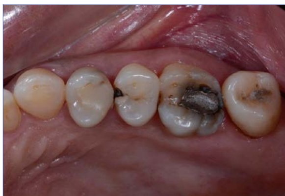
Figure 1. Preoperative occlusal view: insufficient amalgam restoration.