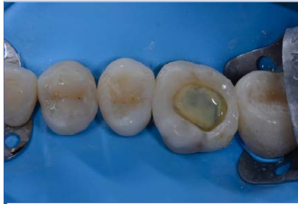
Figure 8. After the polymerization of the tint.