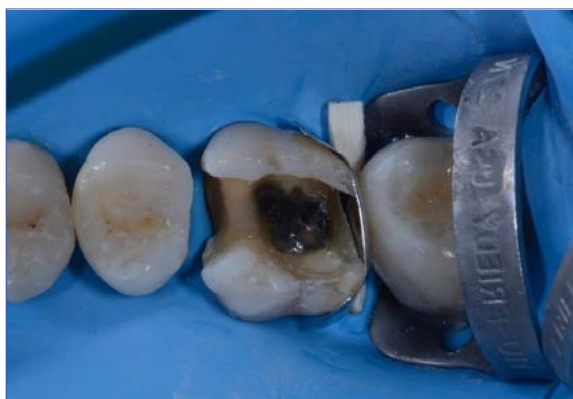
Figure 2. Postoperative situation: examination of the dark discoloration.

Z350 XT-3M, ESPE) to mask a severely discolored background by the application of a layering technique. Three groups presented clinically acceptable color difference values; however, the Filtek Z350 XT system was the only restoration system capable of masking the C4 background. Moreover, Ikeda et al.[4] evaluated the translucency parameter and masking ability of three resin composites with two shades (A3 and opaque A3) and in 1 and 2 mm thicknesses. They concluded only 2 mm thickness of the opaque-shade materials could mask the dark background. However, Darabi et al.[5], compared the translucency parameter of five different opaque or dentin A2 shade resin composites Gradia (GC; Tokyo, Japan), Herculite XRV (Kerr, Scafati, Salerno, Italy), Vit-I-escence (Ultradent, South Jordan, UT, USA), Crystalline (Confidental, Louisville, KY, USA) and Opallis (FGM, Joinville, Brazil) in different thicknesses and evaluated their masking ability in black backgrounds. They concluded that in relatively thin thicknesses, these opaque/dentin shade composite resins could not mask the black background color.