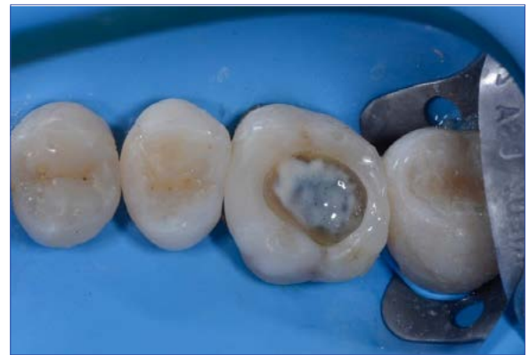
Figure 6. Opaquer placement to the discolored pulpal wall.

with a medium weight rubber dam (Nictone, MDC Dental, Mexico).