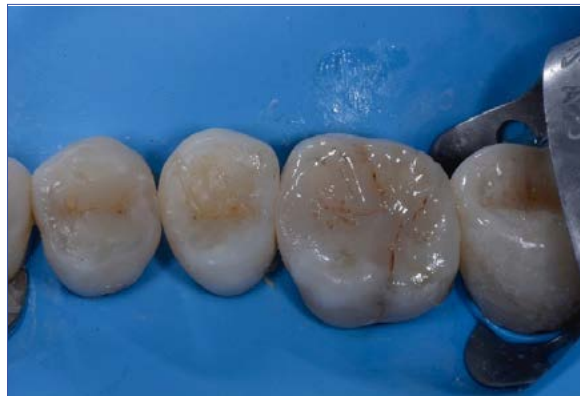
Figure 10. Enamel shade composite placement of the same system.

ticulating paper to confirm that the restoration conformed precisely to the patients pre-existing occlusal scheme, in both the intercuspal position and all excursions (Fig. 11). Finishing for accomplishing contouring, shaping and smoothing of the restoration were performed with an extra-fine diamond bur and aluminum oxide disks (Sof-Lex, 3M ESPE AG, Seefeld, Germany), in order to give the proper anatomical morphology and simultaneously to remove all excess at the tooth restoration interfaces. For the polishing, a two-step silicon-rubber polishing cups system (Flexi Cups, Cosmedent, Chicago, IL, USA) and a 5 \mu m diamond-polishing paste (Diamond Polish Mint, Ultradent Products Inc, South Jordan) were used for 30 seconds, to achieve a higher surface gloss. The final restoration and the neighboring teeth were photographed at the end of the restoration (Fig. 12).