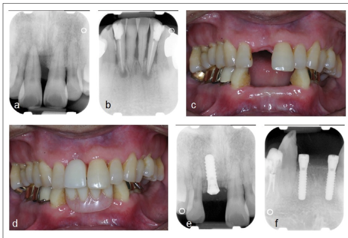
Figure 1. C.M. (male, 50):