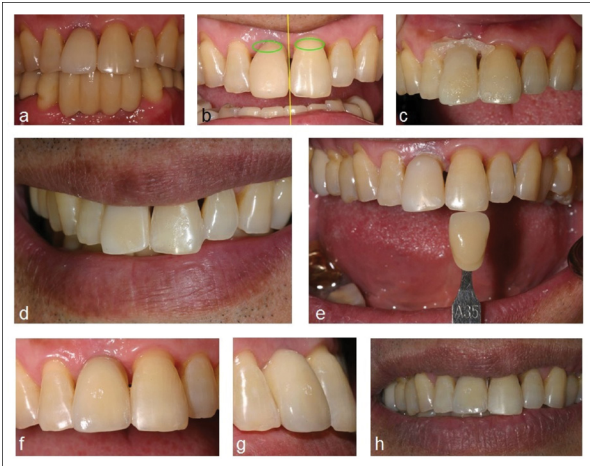
Figure 5. CM (male, 50):