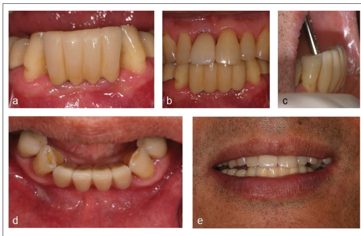
Figure 4. Clinical appearance of final restoration 42 to 32 with "modified ridge lap" design from implant platforms to achieve lip support and esthetics:

a) buccal view; b) buccal view - maximum intercuspation; c) lateral view; d) occlusal view; e) patient reports adequate lip support and "feel"