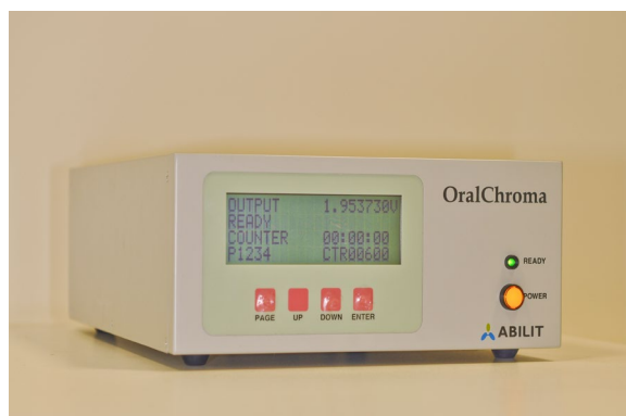
Figure 1. Gaschromatograph OralChroma™

This experiment aims to detect the presence of halitosis with a gaschromatograph OralChroma™ (Fig. 1).