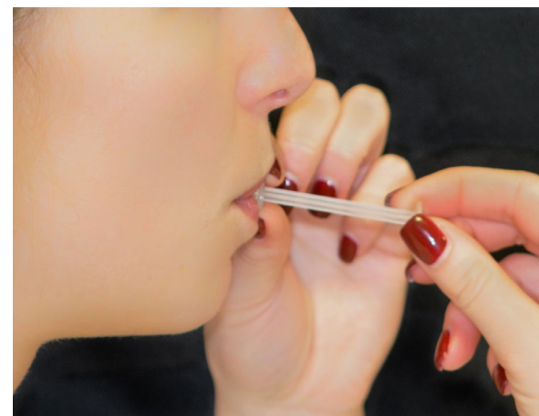
Figure 3. After 60 seconds, the patient must open and close the syringe plunger 2 times, without letting saliva inside

The data obtained were collected in Excel sheets and analyzed by an analysis software. A statistical test for independent samples, Mann-Whitney test, and a statistical significance test used in the analysis of contingency tables, Fisher's exact test, was used to compare the two groups, a value difference of p < 0.05 was considered statistically significant. The graphic system chosen to show the data is a box plot.