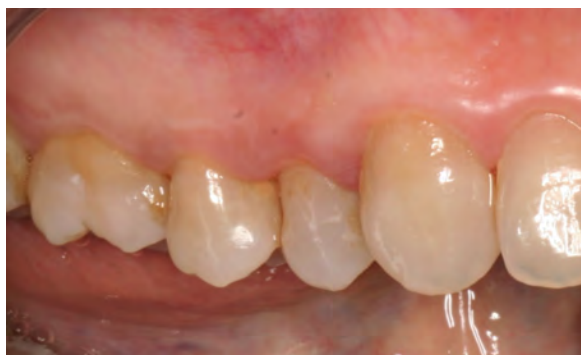
Figure 1. Patient requesting desensitization treatment for vestibular areas of maxillary teeth. No presence of cervical lesions or abrasions could be identified as well as other lesions, yet upper right and upper left canines and premolars scored 7 on VAS after air blast test.

The targeted area was first cleaned with a cotton pellet. Then, the dentist mixed the powder with the liquid for 15 s to obtain a paste that was immediately applied on the treated areas with a microbrush by gently brushing for 2 min (Fig. 1 to 4). In the same visit, both test and placebo treatments were applied to each patient according to a randomization list. Patients were then asked to rinse their mouth, and within 15 min after the treatment the blinded dentist applied the same air blast stimuli under the same conditions to assess pain scores after treatments (POST). Patients were recalled for hypersensitivity assessment of the treated areas after 1 week. At that time point, after data collection, both dentist and patients were unblinded regarding the test or placebo treatment, and the test treatment was applied to the area that previously received the placebo compound. Patients were then recalled after 1, 3 and 6 months and at each recall the dentist assessed only tooth areas that were treated with test compound since the beginning of the trial.