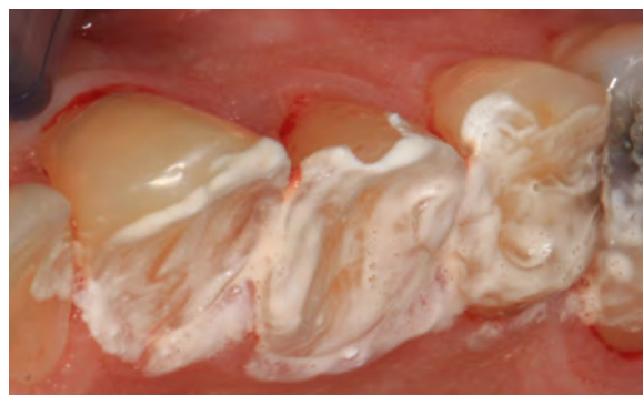
Figure 4. Application of the test DD on the same area as in Fig 3.