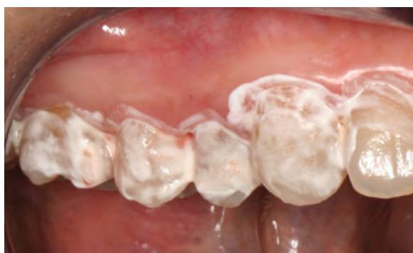
Figure 2. Application of the tested DD on right maxillary teeth (test site), same area depicted in Fig 1.