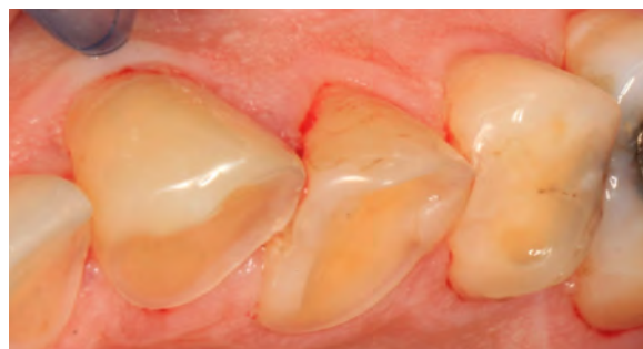
Figure 3. Dental occlusal erosions bilaterally on palatal side of maxillary frontal and lateral teeth. Air blast test scored 8. Patient was referred to a gastroenterologist physician. He was later diagnosed with gastroesophageal reflux disease (GERD) and given treatment. Patient refused restorative therapies, requesting treatment of pain symptoms only.

ordinal VAS scores), were not normally distributed and homoscedasticity was not respected, non-parametrical ANOVA and non-parametric comparisons for each pair using Wilcoxon method ( p < 0.05 ) were used to highlight significant differences between groups.