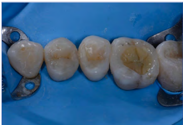
Figure 9. Stratification of the composite resin of dentin shade.