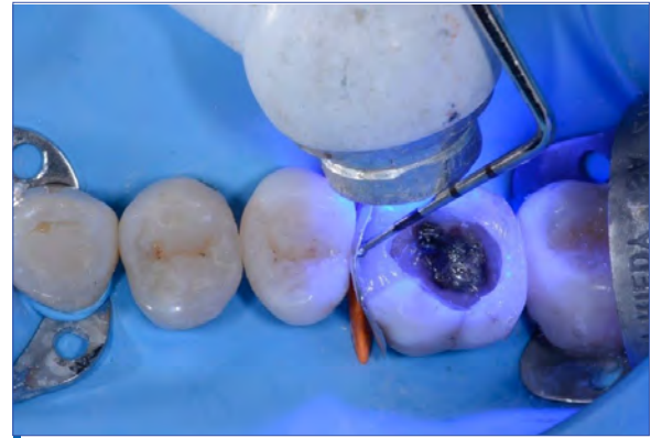
Figure 4. Pressing the sectional matrix towards the neighboring tooth to perform the appropriate contact point.