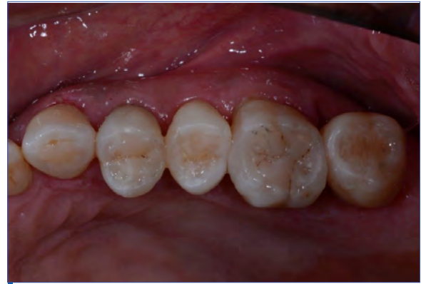
Figure 12. Final occlusal view.

of obtaining an optimal result can be more difficult due to the effect of the underlying resin cement. The tooth shade can also vary somewhat after placing the specific restorations because of a color shift in the polymerized resin cement. On the contrary, the shade of direct composite restorations can be easily modified in order to obtain the optimal result.