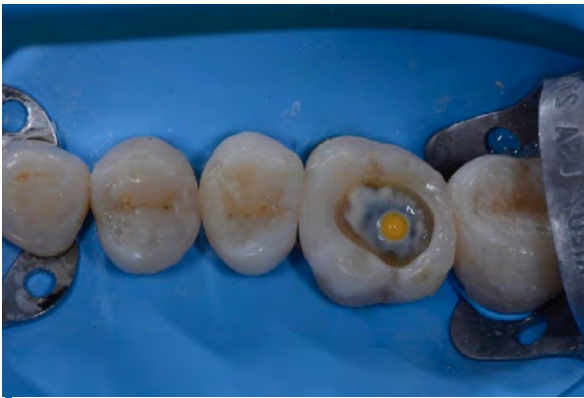
Figure 7. Corn color placement with a small round painter's brush.