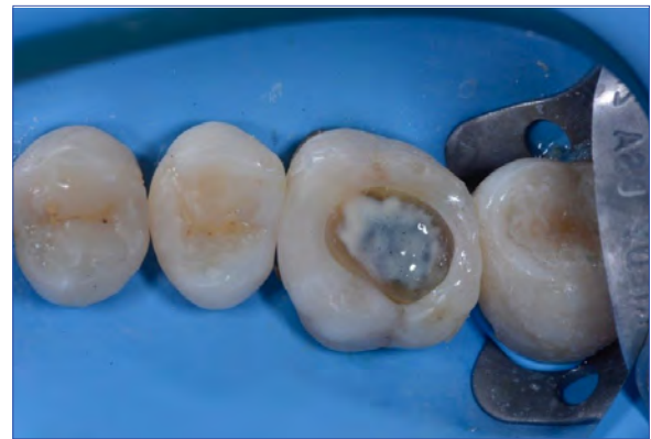
Figure 6. Opaquer placement to the discolored pulpal wall.

occlusally and distally with a medium pear diamond (856, 0.16 mm, 10 mm, Comet Gebr., Brasseler) under water-cooling.