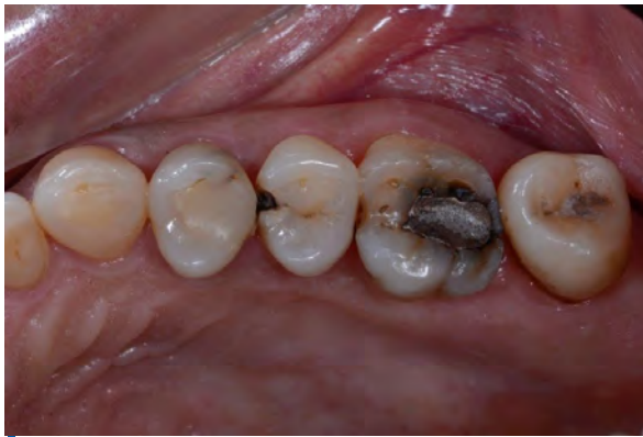
Figure 1. Preoperative occlusal view: insufficient amalgam restoration.