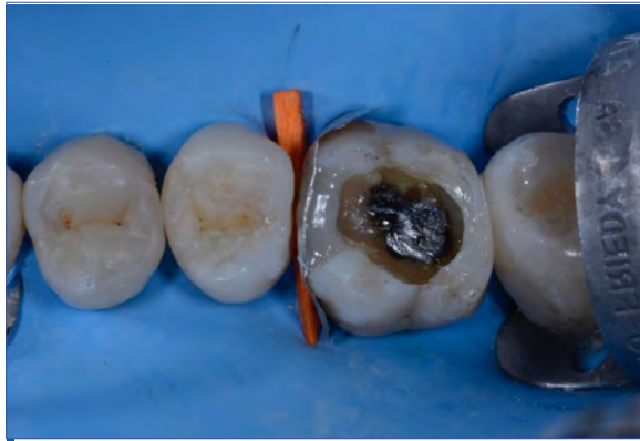
Figure 3. Formation of the distal and mesial walls with enamel shade resin.