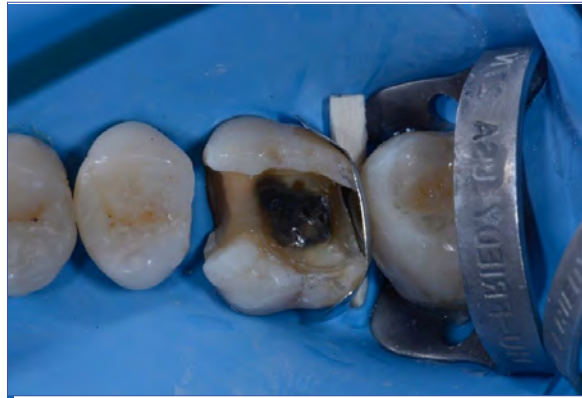
Figure 2. Postoperative situation: examination of the dark discoloration.

and masking ability of three resin composites with two shades (A3 and opaque A3) and in 1 and 2 mm thicknesses. They concluded only 2 mm thickness of the opaque-shade materials could mask the dark background. However, Darabi et al. [5], compared the translucency parameter of five different opaque or dentin A2 shade resin composites Gradia (GC; Tokyo, Japan), Herculite XRV (Kerr, Scafati, Salerno, Italy), Vit-I-escence (Ultradent, South Jordan, UT, USA), Crystalline (Confi-dental, Louisville, KY, USA) and Opallis (FGM, Joinville, Brazil) in different thicknesses and evaluated their masking ability in black backgrounds. They concluded that in relatively thin thicknesses, these opaque/dentin shade composite resins could not mask the black background color.