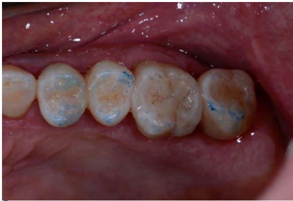
Figure 11. Checking occlusion.