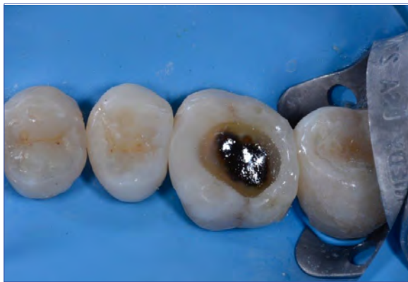
Figure 5. Occlusal view after polymerization of the proximal walls.