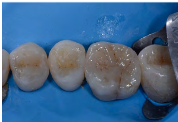
Figure 10. Enamel shade composite placement of the same system.

were performed with an extra-fine diamond bur and aluminum oxide disks (Sof-Lex, 3M ESPE AG, Seefeld, Germany), in order to give the proper anatomical morphology and simultaneously to remove all excess at the tooth restoration interfaces. For the polishing, a two-step silicon-rubber polishing cups system (Flexi Cups, Cosmedent, Chicago, IL, USA) and a 5 \mu\text{m} diamond-polishing paste (Diamond Polish Mint, Ultradent Products Inc, South Jordan) were used for 30 seconds, to achieve a higher surface gloss. The final restoration and the neighboring teeth were photo-documented at the end of the restoration (Fig. 12).