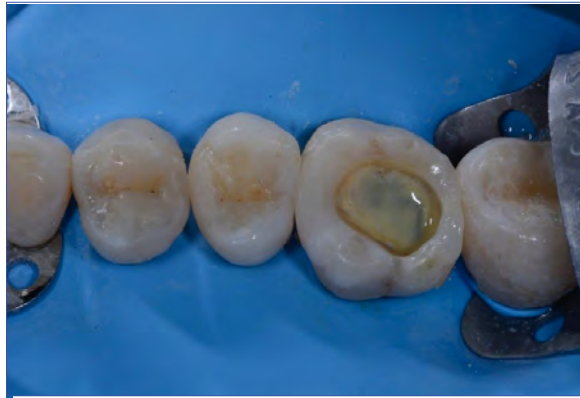
Figure 8. After the polymerization of the tint.