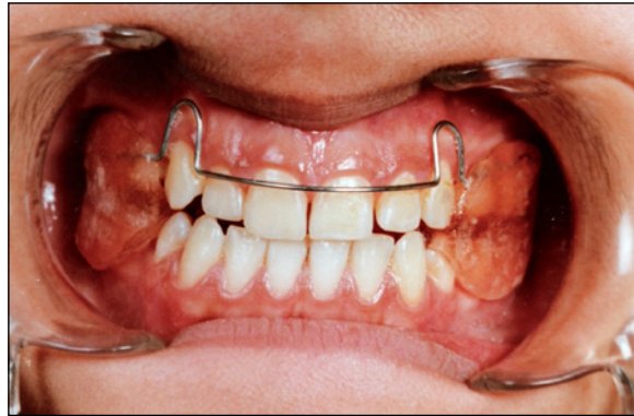
Figure 2. The R-appliance in the mouth