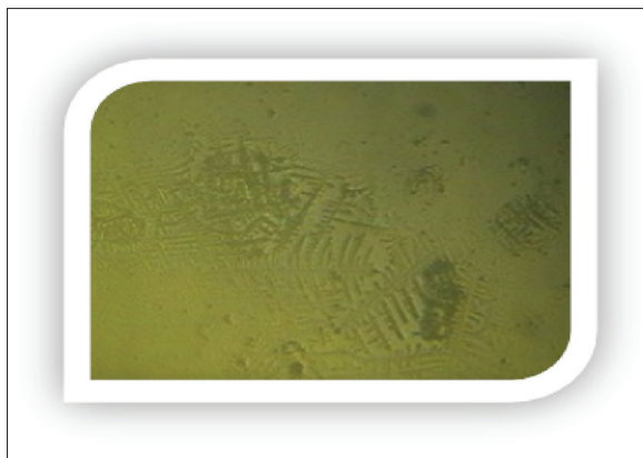
Figure 3. IMK = 0,4