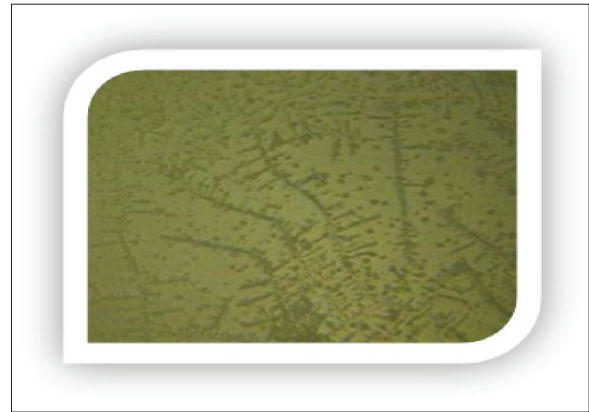
Figure 2. IMK = 0,8