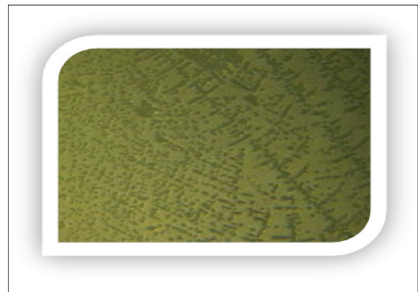
Figure 6. IMK = 0,8