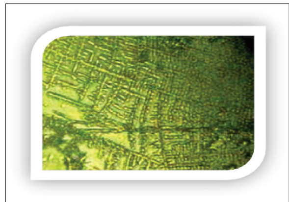
Figure 4. IMK = 0,8