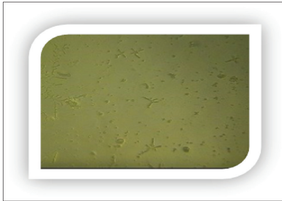
Figure 1. IMK = 0,2