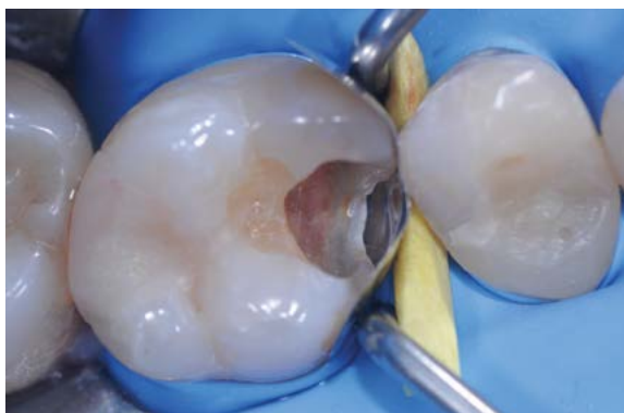
Figure 2. The situation is shown after positioning of the rubber dam, cleaning the cavity and positioning of a curved partial matrix execution of retentive walls, bevels, notches, or unnecessary removal of healthy tooth tissue.