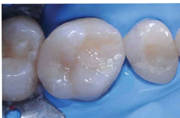
Figure 3. The restoration after application of high-viscosity GIC. The removal of the matrix was performed after 3 min. from mixing time to ensure the initial hardening of the material.