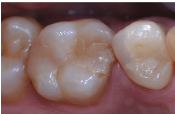
Figure 1. A mesio-occlusal class II composite restoration is shown in an upper right first molar. The restoration margins present chippings and the restoration itself is not functional.