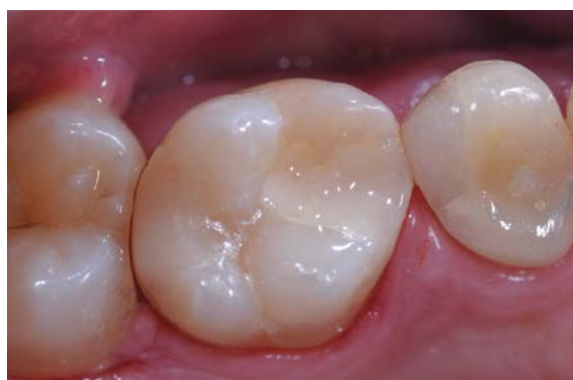
Figure 4. The completed restoration after rubber dam removal, occlusal check, finishing and application of the resin coating. The coating confers the "glossy" appearance to the restoration. Good marginal adaptation and overall acceptable aesthetics of the restoration can be recognized.

due to a poor level of marginal sealing and a relatively low resistance to wear (12). Glassionomer cements for dental restorations also acquired the label of cheap materials, not of high quality, especially useful for rapid restoration, and more focussed on social assistance, becoming the material of choice for Atraumatic Restorative Dentistry (ART) (14-16). Recently, the introduction of nanotechnology in dentistry allowed for significant structural changes in many dental materials, from impression materials (17) to resin composites (18,19), and in particular also for glassionomer cements (17,19). In particular, the limits of hardness and resistance to stress of GICs have been significantly improved, and modern GICs can also give an aspect of natural translucency and coloration to restorations, representing a valid aesthetic solution (20,21).