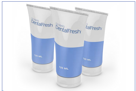
Dr. Mark's DentalFresh (Dr. Mark's HyGenie Pty Ltd., Perth, Wa 6000, Australia) https://drmarkshygenie.com/ .