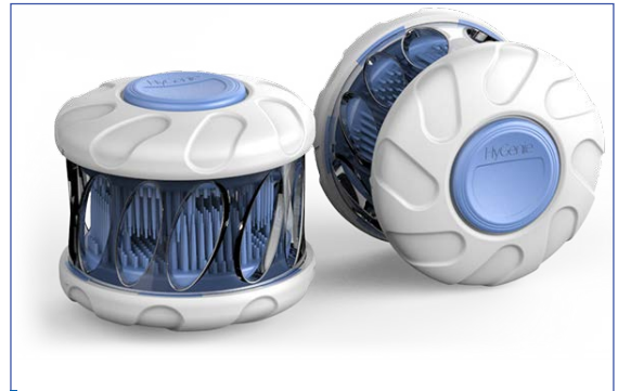
Dr. Mark's HyGenie device (Dr. Mark's HyGenie Pty Ltd., Perth, Wa 6000, Australia) https://drmarkshygenie.com/ .

Let me also take this opportunity to warmly recommend it to you.