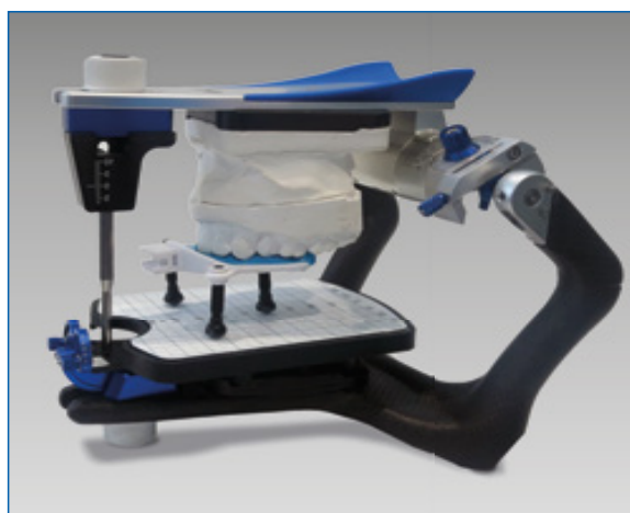
Transfer stand for transferring the maxillary position to mechanical articulators using the bite fork