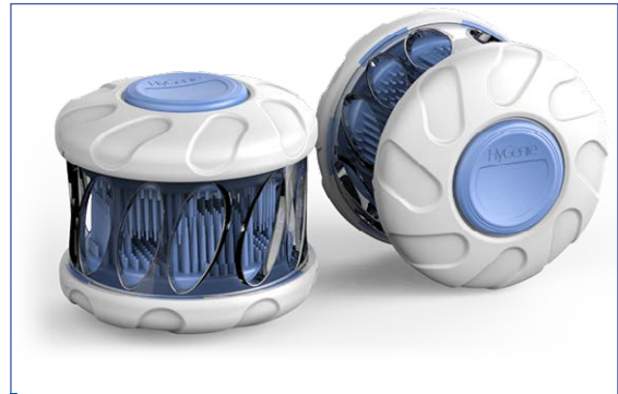
Dr. Mark's HyGenie device (Dr. Mark's HyGenie Pty Ltd., Perth, Wa 6000, Australia) https://drmarkshygenie.com/ .

Let me also take this opportunity to warmly recommend it to you.