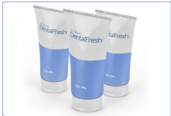
Dr. Mark's DentalFresh (Dr. Mark's HyGenie Pty Ltd., Perth, Wa 6000, Australia) https://drmarkshygenie.com/ .