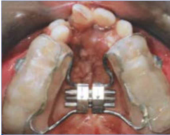
Figure 1. Intraoral photograph of bonded maxillary expander in a patient with UCLP.